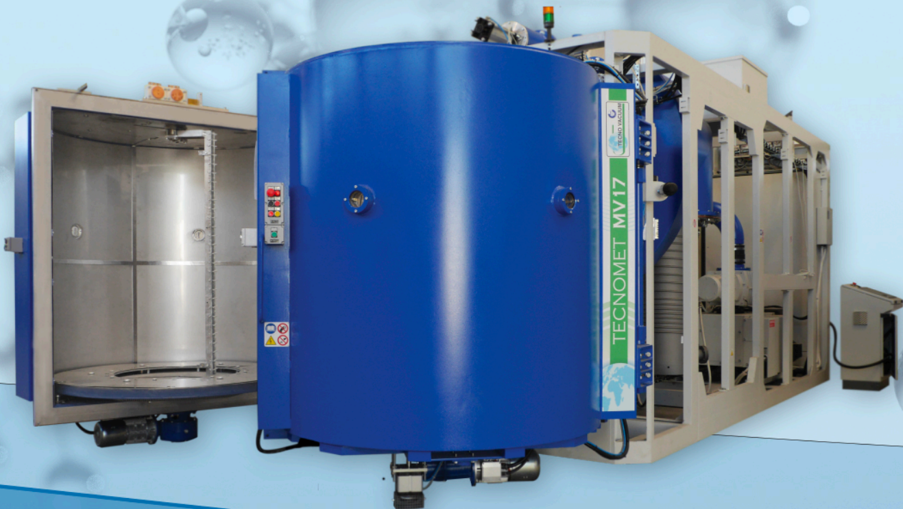
TECNOMET MV Vertical equipment, two doors