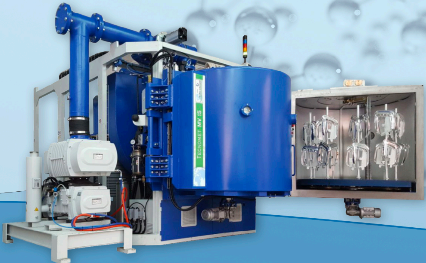
TECNOMET MV Vertical equipment, two doors